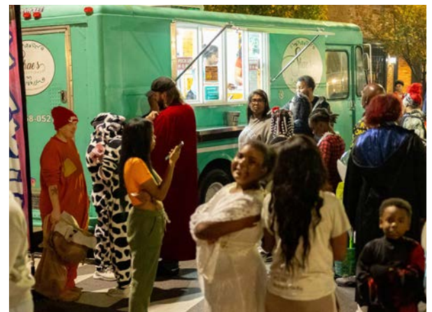
Among the many activities supported by the CSDD are Zombie Walk, a free family-friendly event with food trucks, vendors, artists and more (above left), and 4th Friday, which features visual and performing arts, live music, street performers, and local businesses and is held on the fourth Friday of each month from March to October (above right).